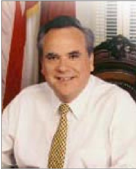
BILL LOCKYER Attorney General

in California's criminal justice community, to translate the best criminal justice research and practice into effective crime-related public policy. Our goal will be to ensure that we work not only harder than ever, but smarter than ever, to combat and control crime.